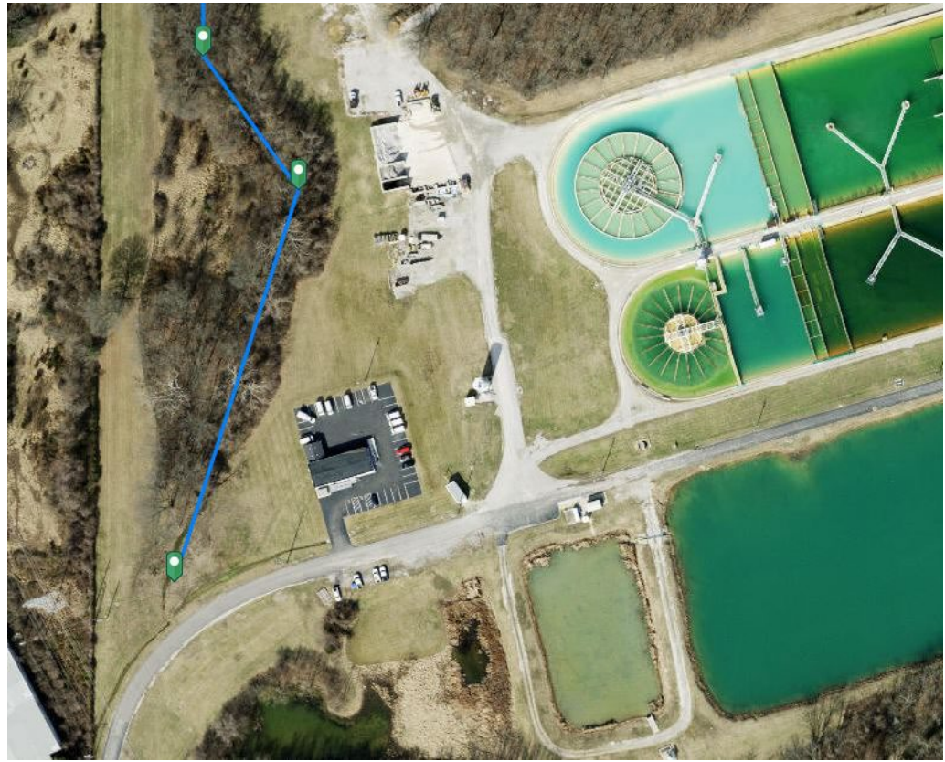
Figure 1 – Project Site

SUBJECT: Pre-2015 Regulatory Regime Approved Jurisdictional Determination in Light of Sackett v. EPA , 143 S. Ct. 1322 (2023), MVS-2024-399